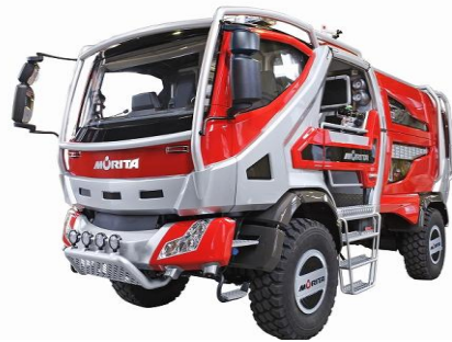
Forest fire fighting concept car