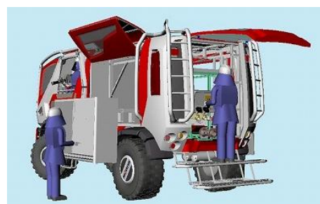
Open side/rear doors and elevating cabinet